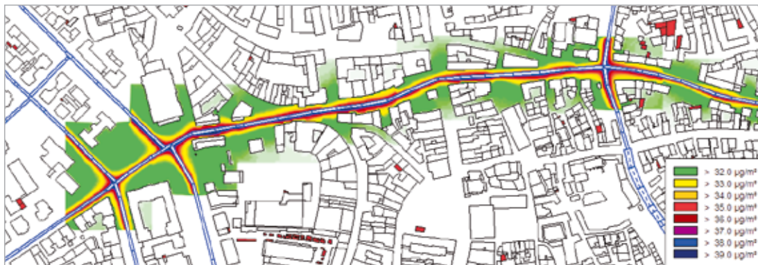
NO 2 -distribution along a main road taking into account the influence of buildings

road and industrial sources, variable wind fields and atmospheric stability and takes account of terrain and buildings. Using the CadnaA PCSP technology (Program Controlled Segmented Processing) for full-automatic tiling, project distribution and processing on a network, the dispersion maps e.g. for traffic induced pollutants, can be calculated for a project of any size.